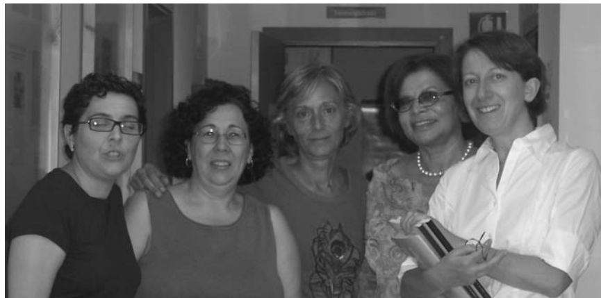
FIU Delegation to the University of Granada, Spain