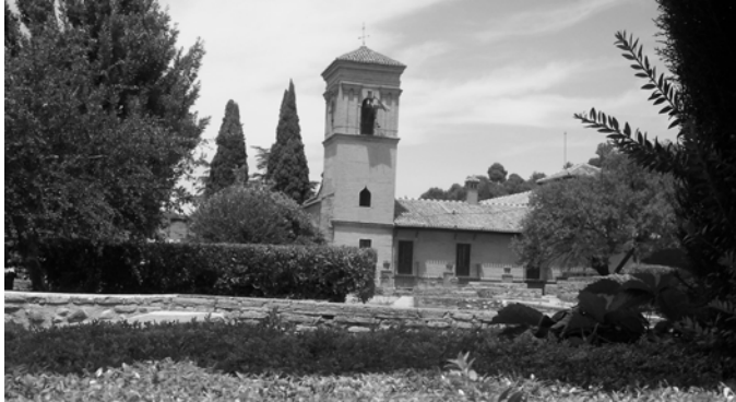
University of Granada, Spain