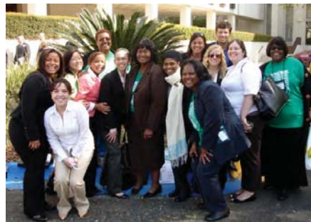
FIU student delegation with fellow lobbyists.