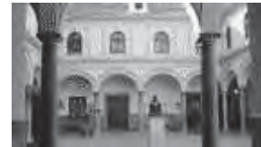
Universidad De Granada

The Consortium is made up of the following Women's Studies Programs: