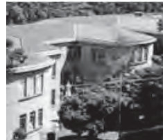
Universidad Nacional De Colombia