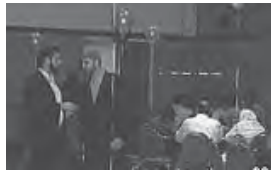
The Islamic Relief speaker with an MSA member.

FIU Women's Studies Center Faculty Meeting and Social , DM 140, Sep. 15, 2006.