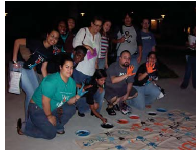
Above: Students joined the "Take Back the Night" march and rally. It was held to promote sexual assault awareness, prevention, and safety on our campus and in our community.