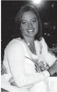
2007 Scholarship Winner