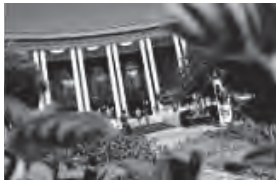
University of the Western Cape