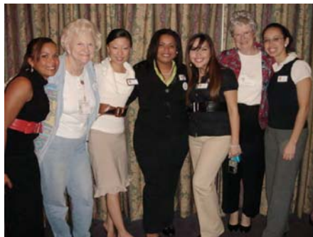
FIU student delegation with fellow lobbyists.