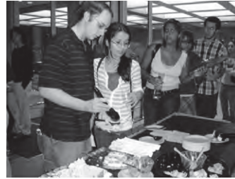
The Vagina Monologues: left: the production team; right: the audience during the reception.