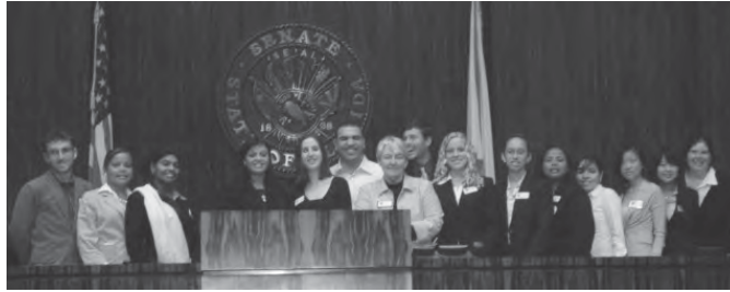
Florida Women's Consortium Lobby Days delegates from FIU.

Donor contributions provided opportunities for travel to our students and faculty.