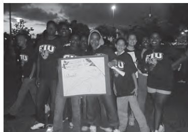
Take Back the Night.