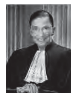
Justice Ruth Bader Ginsburg

FIU College of Law, Dedication of the Rafael Diaz-Balart Hall, Supreme Court Justice Ruth Bader Ginsburg , keynote address (with other dignitaries), Pharmed Arena, Feb. 10, 2007.