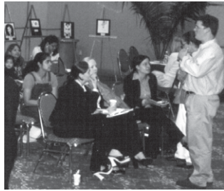
Participants interacting with the artists and guests.

Undergraduate and graduate students doing their own research on women and gender submitted and presented their papers, posters, and artwork during the Third Women's Studies Student Conference on March 31, 2004.